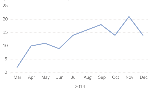
FIGURE 7.2 Samples submitted for analysis by the Energy Control International Drug Testing Service (March–December 2014)

50% of samples were adulterated. Levamisole was the adulterant most frequently detected, in 43% (23 out of 54) of samples. Other adulterants detected in cocaine samples were phenacetin in 9% (5 out of 54), caffeine (1 sample) and lidocaine (1 sample). MDMA samples (in both pill and crystallised forms) showed high levels of purity, and no adulterants or other active ingredients were detected.