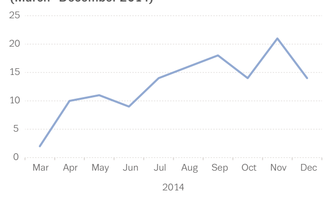
FIGURE 7.2 Samples submitted for analysis by the Energy Control International Drug Testing Service (March–December 2014)

50 % of samples were adulterated. Levamisole was the adulterant most frequently detected, in 43 % (23 out of 54) of samples. Other adulterants detected in cocaine samples were phenacetin in 9 % (5 out of 54), caffeine (1 sample) and lidocaine (1 sample). MDMA samples (in both pill and crystallised forms) showed high levels of purity, and no adulterants or other active ingredients were detected.